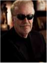
Philip H. Knight

Mr. Donahoe, 55, a director since June 2014, is Chairman of PayPal Holdings, Inc. From 2008 through 2015, Mr. Donahoe served as President and Chief Executive Officer of eBay, Inc. ("eBay"), provider of the global eBay.com online marketplace and PayPal digital payments platform. Mr. Donahoe joined eBay in 2005 as President of eBay Marketplaces, responsible for eBay's global e-Commerce businesses, and was appointed President and Chief Executive Officer in 2008. He has also served on eBay's Board of Directors since 2008. Prior to joining eBay, Mr. Donahoe was the CEO and Worldwide Managing Director of Bain & Company from 1999 to 2005, and a Managing Director from 1992 to 1999. Mr. Donahoe also serves on the Board of Directors of Intel Corporation and is a member of the President's Export Council. Mr. Donahoe was selected to serve on the Board because of his experience in executive and financial management, strategic planning, branding, technology, and digital commerce, which allow him to provide valued perspectives on each of these areas of the Company's business.