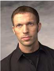
Travis A. Knight

Mr. Knight, 77, a director since 1968, is Chairman of the Board of Directors of NIKE. Mr. Knight is a co-founder of the Company and, except for the period from June 1983 through September 1984, served as its President from 1968 to 1990, and from June 2000 to December 2004. Prior to 1968, Mr. Knight was a certified public accountant with Price Waterhouse and Coopers & Lybrand and was an Assistant Professor of Business Administration at Portland State University. Mr. Knight led NIKE from a small partnership founded on a handshake to the world's largest athletic footwear, apparel, and equipment company. He has extensive knowledge of and experience in Company operations, sports marketing, manufacturing, management, accounting, and financial matters, which make him uniquely qualified to serve as Chairman of the Board.