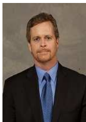
Mark G. Parker

Mr. Parker, 59, has been President and Chief Executive Officer and a director since 2006. He has been employed by NIKE since 1979 with primary responsibilities in product research, design and development, marketing, and brand management. Mr. Parker was appointed divisional Vice President in charge of product development in 1987, corporate Vice President in 1989, General Manager in 1993, Vice President of Global Footwear in 1998, and President of the NIKE Brand in 2001. He has extensive knowledge and experience regarding Company operations, sports marketing, manufacturing, research, design, development, and management, and is an effective leader of NIKE. His position as Chief Executive Officer makes his participation on the Board critical.