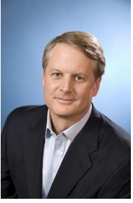
John J. Donahoe II

Mr. Donahoe, 55, a director since June 2014, is Chairman of PayPal Holdings, Inc. From 2008 through 2015, Mr. Donahoe served as President and Chief Executive Officer of eBay, Inc. ("eBay"), provider of the global eBay.com online marketplace and PayPal digital payments platform. Mr. Donahoe joined eBay in 2005 as President of eBay Marketplaces, responsible for eBay's global e-Commerce businesses, and was appointed President and Chief Executive Officer in 2008. He has also served on eBay's Board of Directors since 2008. Prior to joining eBay, Mr. Donahoe was the CEO and Worldwide Managing Director of Bain & Company from 1999 to 2005, and a Managing Director from 1992 to 1999. Mr. Donahoe also serves on the Board of Directors of Intel Corporation and is a member of the President's Export Council. Mr. Donahoe was selected to serve on the Board because of his experience in executive and financial management, strategic planning, branding, technology, and digital commerce, which allow him to provide valued perspectives on each of these areas of the Company's business.