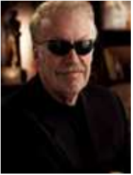
Philip H. Knight