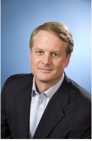
John J. Donahoe II

Mr. Donahoe, 55, a director since June 2014, is Chairman of PayPal. From 2008 through 2015, Mr. Donahoe served as President and Chief Executive Officer of eBay, Inc. ("eBay"), provider of the global eBay.com online marketplace and PayPal digital payments platform. Mr. Donahoe joined eBay in 2005 as President of eBay Marketplaces, responsible for eBay's global e-Commerce businesses, and was appointed President and Chief Executive Officer in 2008. He has also served on eBay's Board of Directors since 2008. Prior to joining eBay, Mr. Donahoe was the CEO and Worldwide Managing Director of Bain & Company from 1999 to 2005, and a Managing Director from 1992 to 1999. Mr. Donahoe also serves on the Board of Directors of Intel Corporation and is a member of the President's Export Council. Mr. Donahoe was selected to serve on the Board because of his experience in executive and financial management, strategic planning, branding, technology, and digital commerce, which allow him to provide valued perspectives on each of these areas of the Company's business.