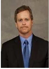
Mark G. Parker

Mr. Parker, 59, has been President and Chief Executive Officer and a director since 2006. He has been employed by NIKE since 1979 with primary responsibilities in product research, design and development, marketing, and brand management. Mr. Parker was appointed divisional Vice President in charge of product development in 1987, corporate Vice President in 1989, General Manager in 1993, Vice President of Global Footwear in 1998, and President of the NIKE Brand in 2001. He has extensive knowledge and experience regarding Company operations, sports marketing, manufacturing, research, design, development, and management, and is an effective leader of NIKE. His position as Chief Executive Officer makes his participation on the Board critical.