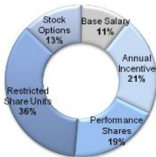
CEO’s TARGET PAY MIX Lourenco Goncalves